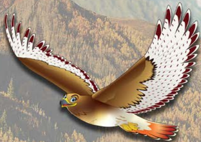
AVA THE HAWK